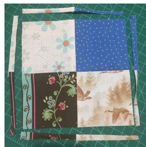
Trim completed 4-patch blocks down to 6" so they'll match our Snowball block!