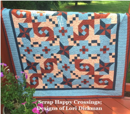
Scrap Happy Crossings; Designs of Lori Dickman

My new pattern, Scrap Happy Crossings , Is now available for