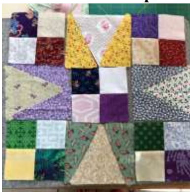
Block A from Scraps!