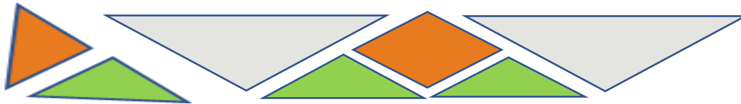
Queen Org/Grn Triangle/Diamond Unit (above).