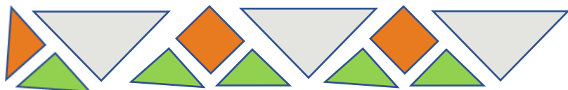
Wall Border Org/Grn Triangle/"Square" unit (above).

Continue sewing Triangle units as shown; sew (5) sets of Org/Grn Triangles units with (6) Light Lg. Triangles for each Border row. Sew Corner Triangle units (Org/Grn) to each end of the Border rows.