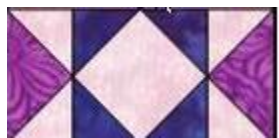
Row Two & Three:

Sew a Flying Geese Unit to both ends of the Center Square unit as shown. Be sure to orient the Flying Geese units properly.