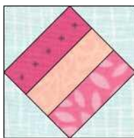
“Square in a Square Variation Block” (9.5" x 9.5" unfinished)