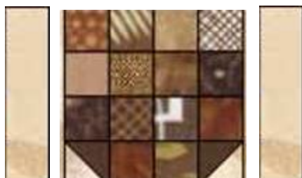
Acorn Unit with 8.5” Rectangles sewn to each side.