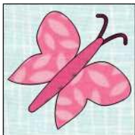
“Butterfly” (9.5” x 9.5” unfinished block size)