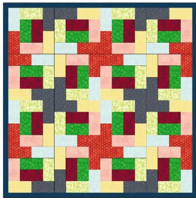
Quilt using Dark center blocks