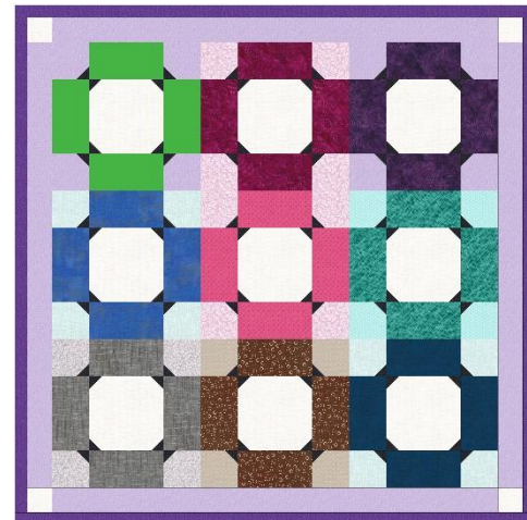
(No sashing - 42" x 42")